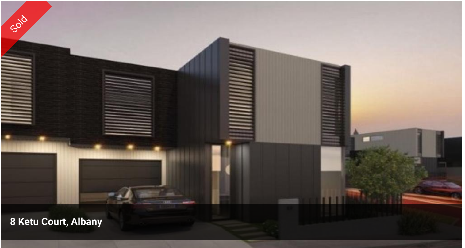
8 Ketu Court, Albany