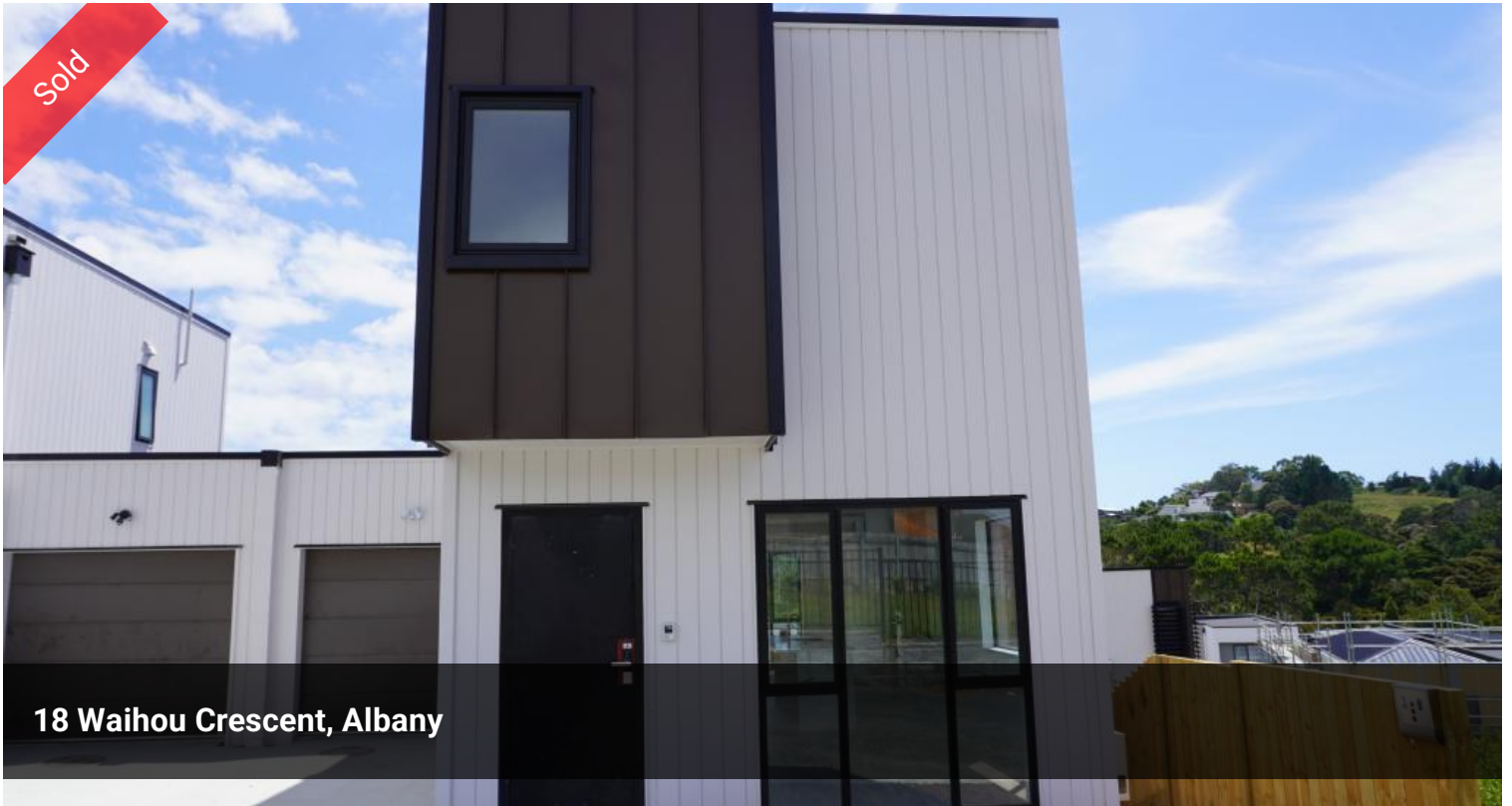
18 Waihou Crescent, Albany