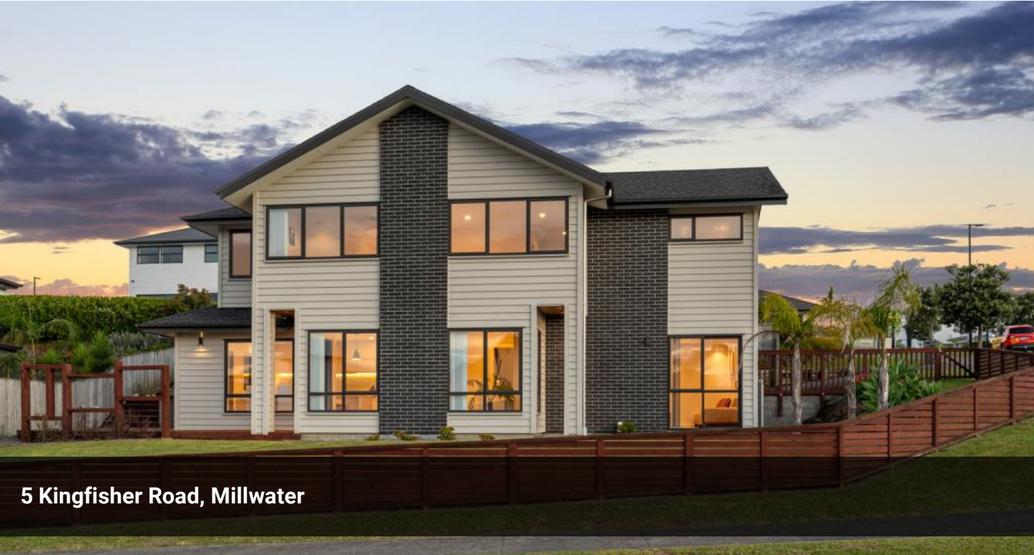
5 Kingfisher Road, Millwater