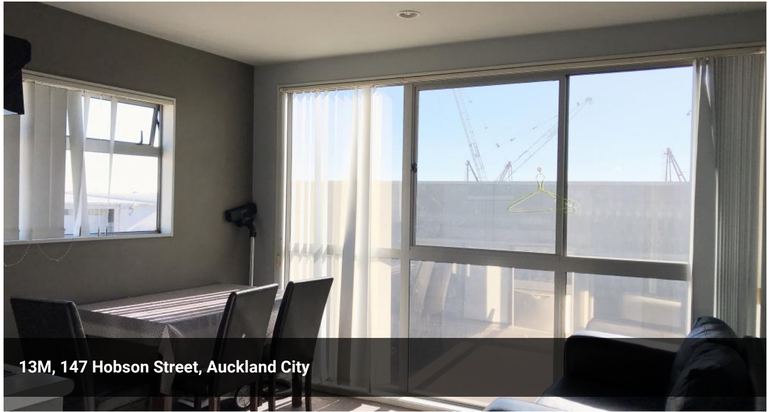
13M, 147 Hobson Street, Auckland City