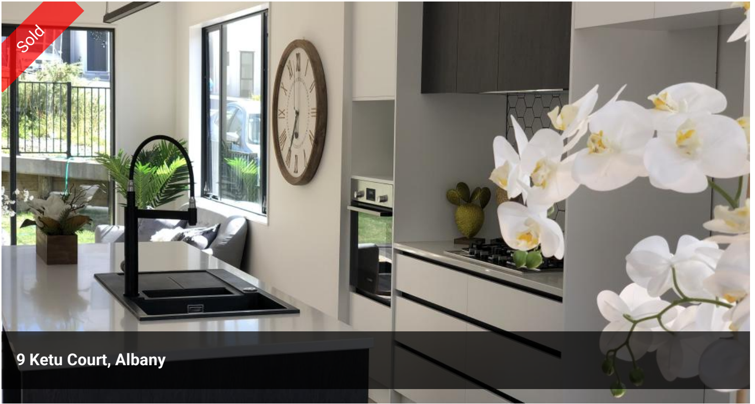
9 Ketu Court, Albany